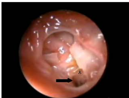
Fig. 2: Surgical anatomy of region. (A) Location of sphenopalatine foramen. with detailed magnification of window indicated in A (bone of palatine processes has been removed) and some simplified details of anatomy of sphenopalatine fossa. Sphenopalatine artery is anterior and superior to sphenopalatine ganglion, so needle (arrowed) should be inserted anteroposteriorly into inferior portion of sphenopalatine foramen, pointing upward

The nasal cavity, between the middle and inferior turbinates, from nares to posterolateral wall of the nasopharynx was anesthetized topically with 5% lidocaine + 1:200,000 epinephrine using cotton-tipped applicators. This passage was sterilized by an additional cotton-tipped applicator soaked with iodine solution. A 20-gauge/5-inch spinal needle was used for the transnasal injection. The exposed needle tip was bent along the port side with a sterile needle-holder to form a 45° angle, so that the side port indicator on the hub became a tip